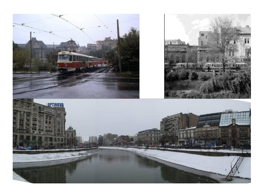
Fig.:.Above, the river in the late 1970s, and beneath, the river nowadays

URL: <a href="http://jedep.spiruharet.ro">http://jedep.spiruharet.ro</a> e-mail: office jedep@spiruharet.ro