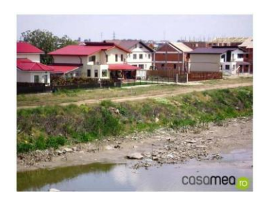
Fig.4:The Casamea residential villas (www.casamea.ro): no territorial intervention whatsoever upon integrating the river banks as public, common space for the neighborhood.