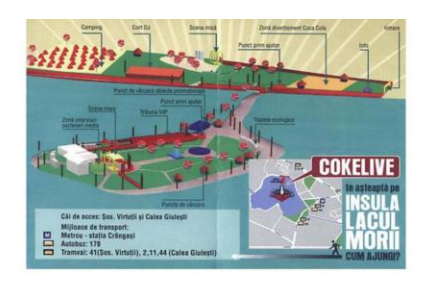
Fig.8: Cokelive 2007

URL: <a href="http://jedep.spiruharet.ro">http://jedep.spiruharet.ro</a> e-mail: <a href="mailto:office">office</a> jedep@spiruharet.ro