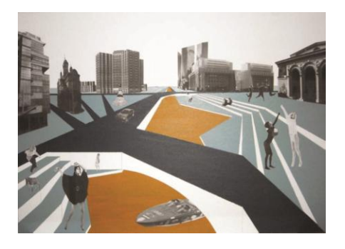
Fig. 11: Opera Plaza

Their manifesto focuses on the Opera Plaza.