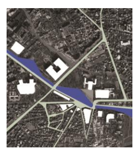
Fig. 10: Banks thus alternate in their use

functions would benefit private car traffic and a more remote approach to the river side. The banks thus alternate in their use, but both integrate the river in the urban space and users' daily life.