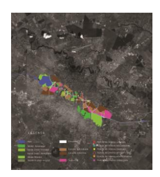
Fig. 9. Pedestrian and open towards the river and private car traffic.

The division follows the functions along the river: areas of public interest, cultural zones and residential neighbourhoods would be served only by public transportation and their banks would be topographically remodeled in an organic, free manner, enabling the public to come into direct contact with the river. The other