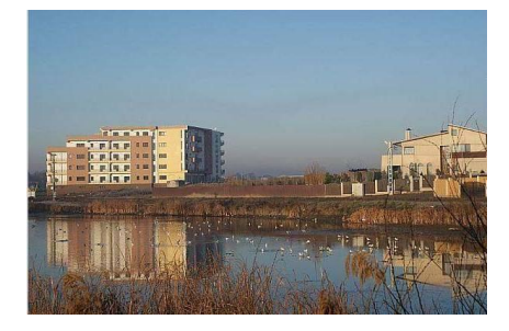
Fig.5: The (unintended) ironically entitled "Waterlily Lake" new housing ensemble in Chitila; fenced in (ansamblurirezidentiale.ro)