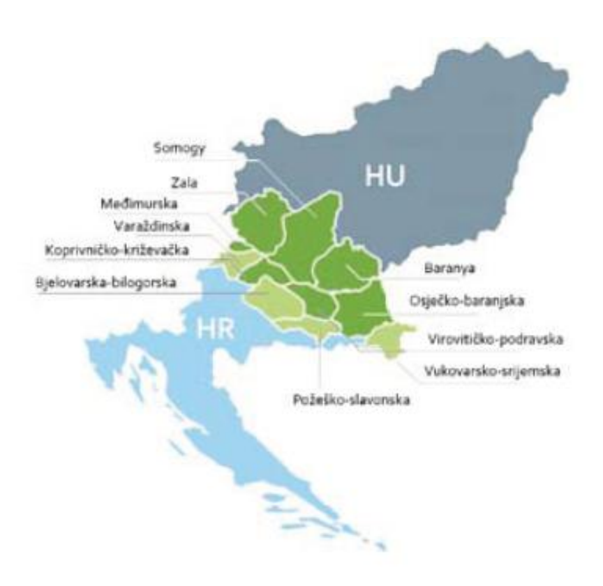
Fig.3. Cross-border areas of Figure Hungary and Croatia covered by the UNIREG IMPULSE project

URL: <a href="http://jedep.spiruharet.ro">http://jedep.spiruharet.ro</a> e-mail: <a href="mailto:office">office</a> jedep@spiruharet.ro