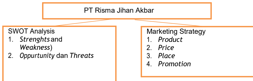
Fig. 1 : Model of Research

Population is a generalization area consisting of objects or subjects that have certain qualities and characteristics determined by researchers to be studied and then conclusions drawn (Sugiyono, 2016: 80). The subjects of this study were marketing and consumers who bought a house in a residential area, RJA, which had a Housing Ownership Loan (HOL) contract.