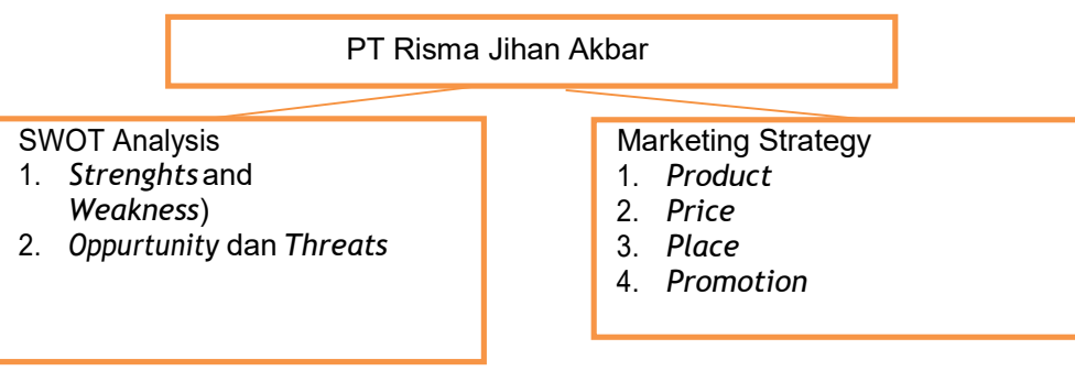
Fig. 1 : Model of Research

The conceptual model of research is the concept of how the theory relates to various defined factors. The conceptual model in this study is